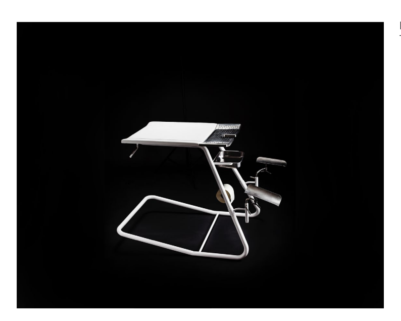
Figure 2 The Androchair.

We have previously described the experiences of the GEC in general, now we will add more detailed description and at the same