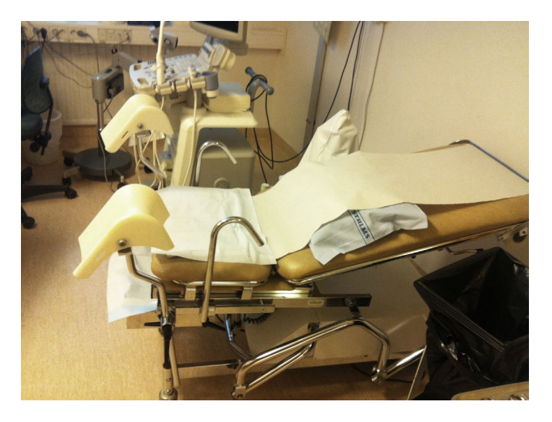
Figure 1 An example of the traditional gynecological examination chair.

The GEC is originally designed for the male examiner's needs without taking into account the woman's perspective (Johannisson 1994; Kapsalis 1997). Traces of this hierarchical mind-set are still to be found when it comes to how contemporary GECs are designed. For example, one of the worlds' leading manufacturers of medical equipment market their GEC with the text "Developed